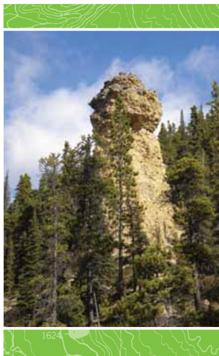
Looking up at the Erosion Pillar