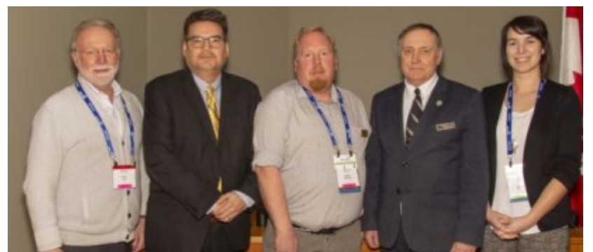
Mayor Foster at the Association of BC Forest Professionals Conference

Regional Council recorded and streamed the February 10, 2020 Council meeting with success. The meeting can be accessed on YouTube by searching NRRM or accessing https://www.northernrockies.ca/councilcast . To date, the February 10, 2020 Regional Council has received 205 views.