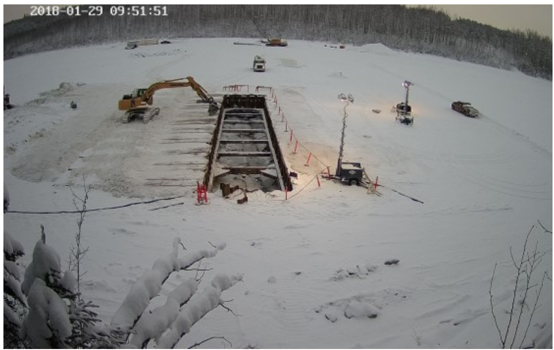
Wastewater Treatment Plant Outfall Relocation Project—Phase 2 (In River Works)