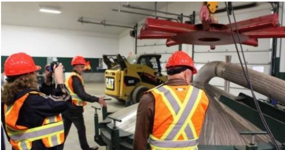
Young Living Facility Tour